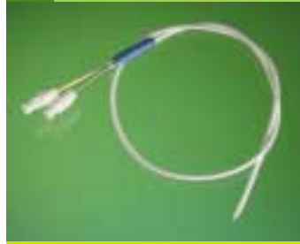
Dual Lumen Catheter